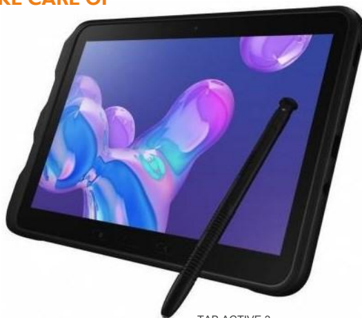
TAB ACTIVE 3

WE TAKE CARE OF THE DETAILS, SO YOU CAN TAKE CARE OF BUSINESS.