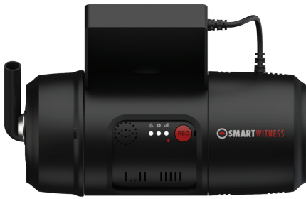
Rear View - Driver Facing