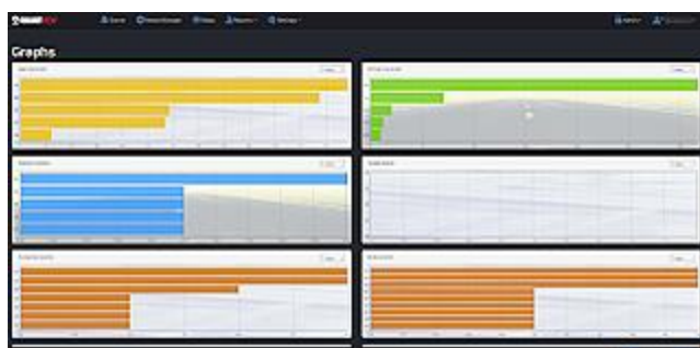
Driver Behavior Reports Dashboard