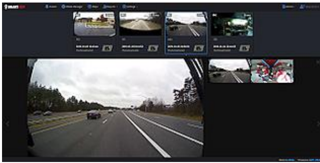
High-Definition Video Audio Playback