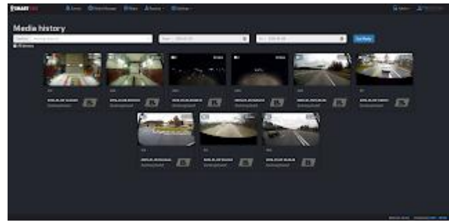
SmartView Video History