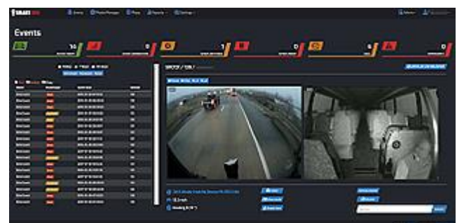
Video Alerts/Events Dashboard