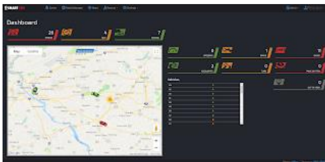
Fleet Overview Dashboard